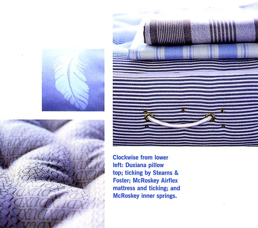
Clockwise from lower left: Duxiana pillow top; ticking by Stearns & Foster; McRoskey Airflex mattress and ticking; and McRoskey inner springs.